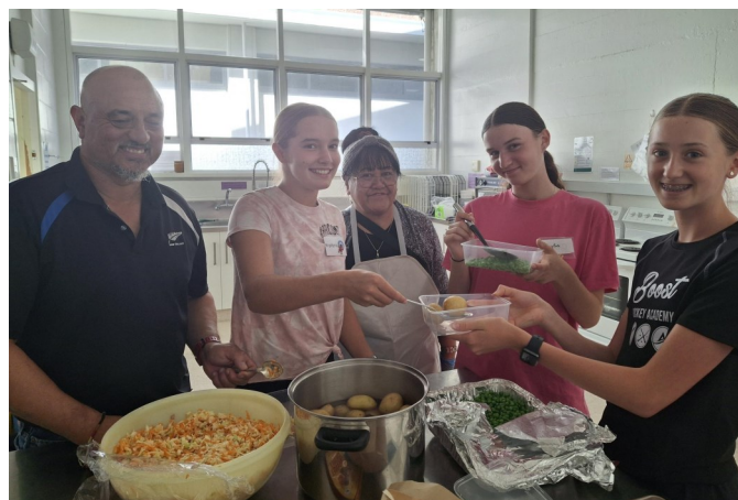
The team packing up the take away meal boxes, first day back on Tuesday.

The route takes about 2 hours and the pick up time for the meals is 5.15pm from St Joseph's Church hall, but it can be later if needed. Please contact Liz 022 643 02 if you would like further details.