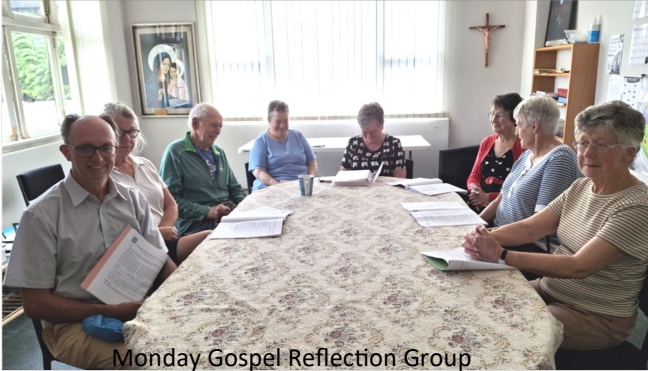
Monday Gospel Reflection Group

MONDAY GOSPEL REFLECTION GROUP meets in the Parish Office each Monday at 9.30am. The group shares the Sunday readings for the coming week. Everyone is welcome to join this group. The readings are provided. Contact the Parish Office for further details, or just come along on Monday.