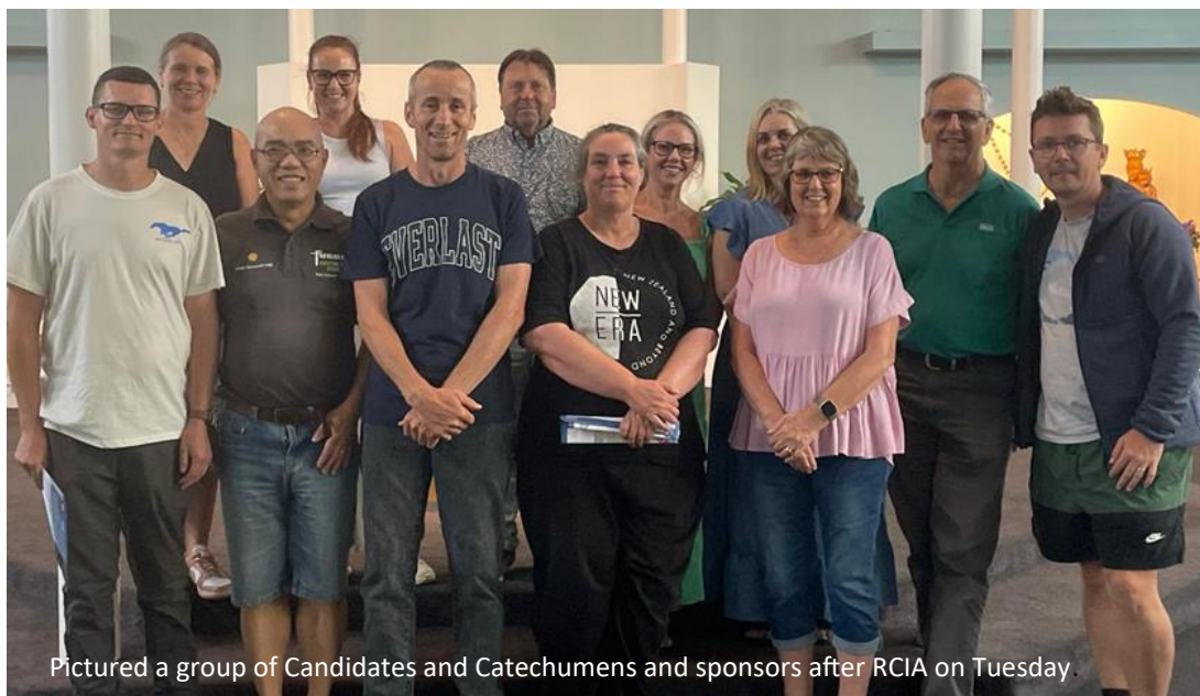
Pictured a group of Candidates and Catechumens and sponsors after RCIA on Tuesday.