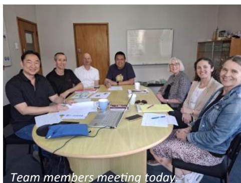
Team members meeting today.

If parishioners would like to help, our request to all parishioners is; "Please join us in prayer". Come Holy Spirit. If you would like to help by offering your services on Friday, 22 and/or Saturday, 23 November, we have roles in hospitality and cleaning on that day. We also still need promises of garden cut flowers for posies and the floral arrangements. And this week's special request is for home baking for the morning and afternoon teas. Again contact the Parish Office, office@catholicparishnp.nz or 06 757 3682.