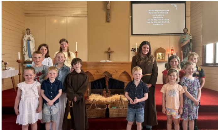
Childrens Mass at St Patrick's Okato 14 December 2024, at the Vigil Mass

The Christmas tree points to heaven and reminds us that God is eternal.