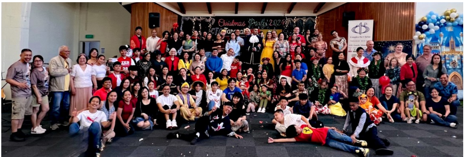
Couples for Christ Christmas Gathering Saturday 14 December, with Praise and Worship and family fun.