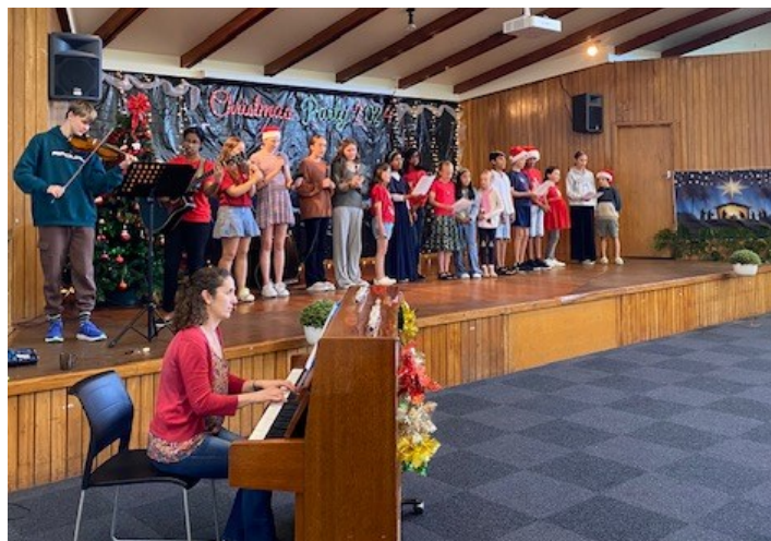
Parish Christmas Concert, featuring our greatly talented and musical youth.