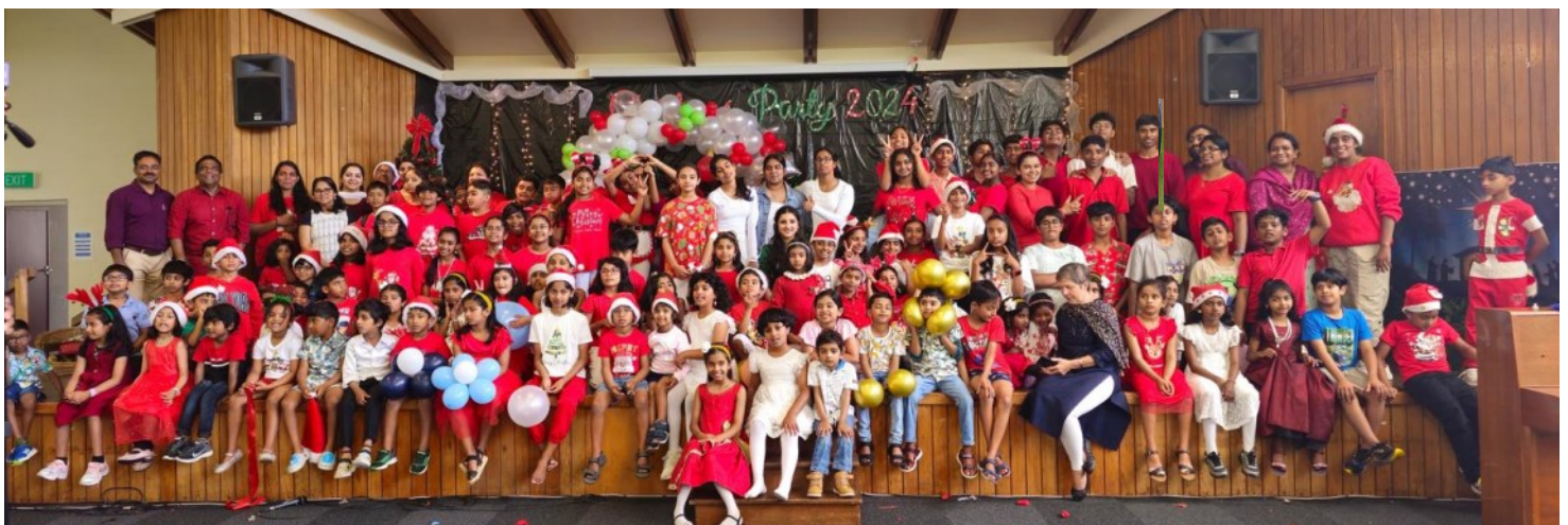
The Syro Malabar Catechism Group Christmas Gathering after 9.00am Mass Sunday 15 December

New Year Eve Mass St Joseph's Church Adoration 31 December 2024 11.00pm to midnight then followed by Mass