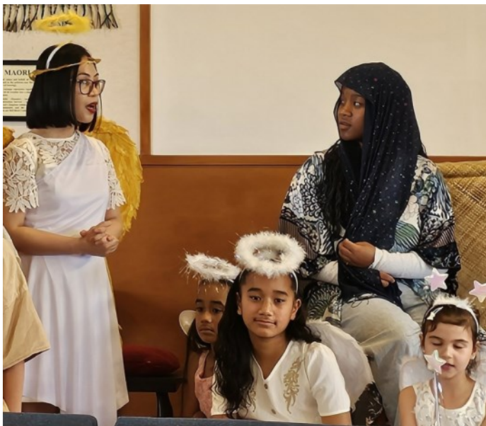
Christmas Carol evening at Bell Block Mass Centre, featuring the angels