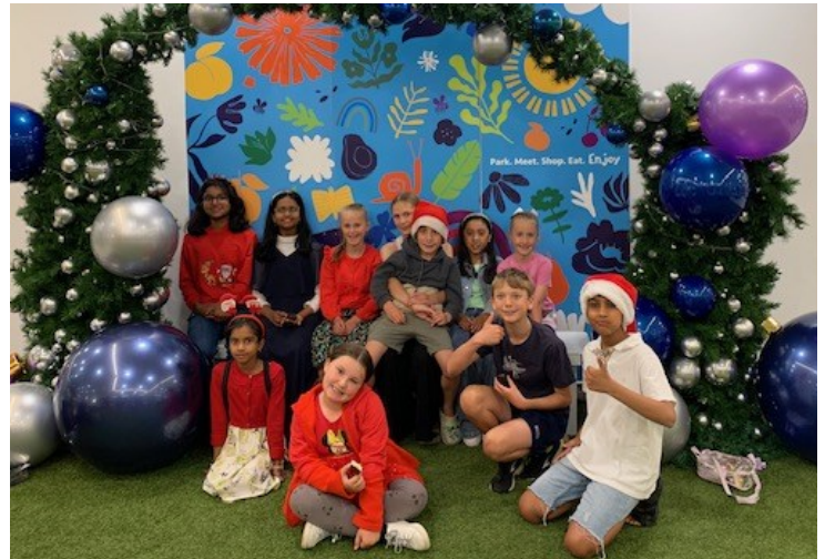
Our wonderful buskers at Centre City on Wednesday. See page 5 of the electronic newsletter for more photos of the busking, including busking with Santa.