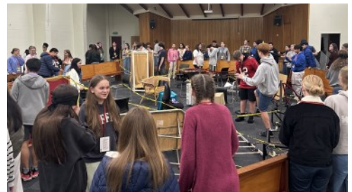
MINEFIELD Blindfolded and led by their friend candidates try to grab chocolate without touching the "mine".