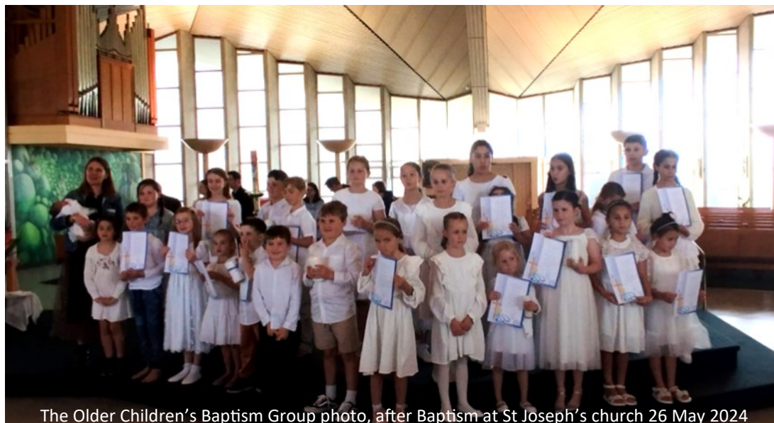
The Older Children's Baptism Group photo, after Baptism at St Joseph's church 26 May 2024