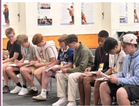
The boys writing letters to God.

We express gratitude to God for the four recent sessions we've had, where we feel the presence of His Holy Spirit every Monday during the programme. Each session begins with engaging games led by junior leaders, creating a fun atmosphere for everyone. Following this, candidates come together for a talk, split into small groups, and conclude with activities like writing affirmations for each other, or composing letters to God and Adoration.