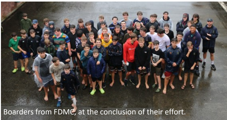
Boarders from FDMC, at the conclusion of their effort.