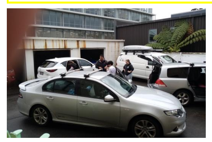
Action in the wet weather, before the Confirmation Camp last Friday. Loading the cars and vans to take supplies for the weekend for the 68 campers and the 27 young leaders (plus the adult helpers). Everything ready to proceed out to Vertical Horizon.

While there may be simple cultural reasons why this took place, there is an interesting theology to be gleaned from the entire liturgy taking its name from the dismissal. The Great Commission (Matt. 28:19-20) was to go out to all the world and preach the Gospel. As Christians we are called to gather and worship but also to go out and proclaim the Gospel through our lives.