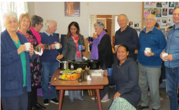
Pictured above: The community joins together after Mass for soup and buns. The Bell Block Mass Centre celebrates Mass at 10.30am on the First Sunday of the month, and Liturgy of the Word with Communion on the third Sunday. Come along! Everyone is welcome at this Mass.

Web: https://safeguarding.catholic.org.nz/