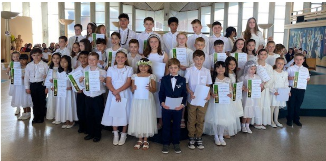
Pictured above: Congratulations to the 42 children who celebrated this milestone in their faith journey and to their families who accompanied them in preparation.